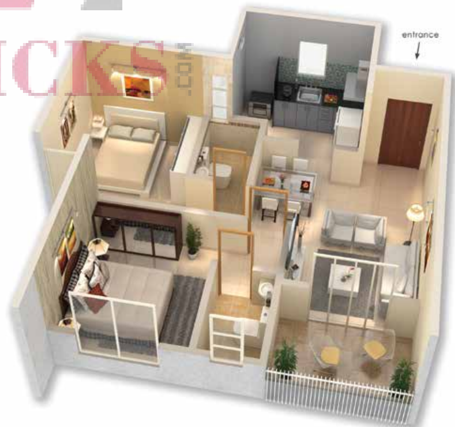
2 BHK TYPE 1 - EVEN FLOOR UNIT PLAN